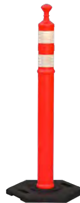
42133-TRU8HIP Grabber-Tube® 42" & 28" opts.