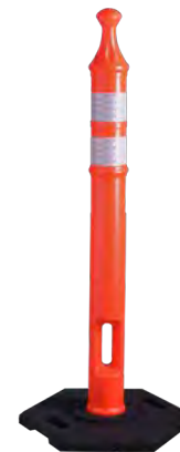
42133-TRU212HIP Grabber-Tube® II 42" only