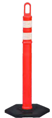
46133-TRU18HIP Looper-Tube® 42" & color opts.